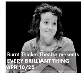
Burnt Thicket Theatre presents EVERY BRILLIANT THING APR 10/25