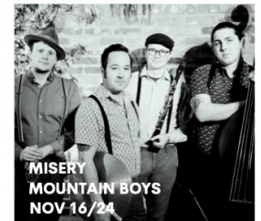
MISERY MOUNTAIN BOYS NOV 16/24