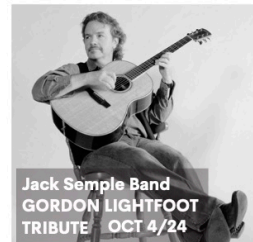
Jack Semple Band GORDON LIGHTFOOT TRIBUTE OCT 4/24